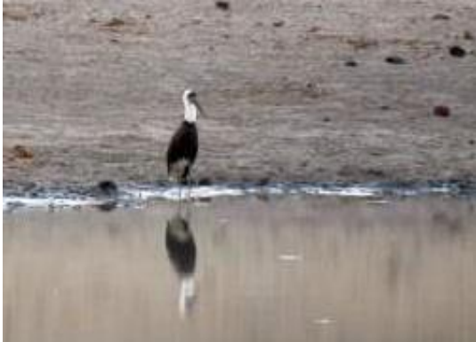
A Woolly-necked Stork in southern Gonarezhou, an Oct dawn in 2018.

Goliath Herons were only seen in Hwange and Gonarezhou, and the only Purple Heron was seen at Kent Estate, whilst the Charama Chicks were the only team to find Black Heron and YAB Hwange Hawks were the sole spotters of Black-crowned Night-heron.