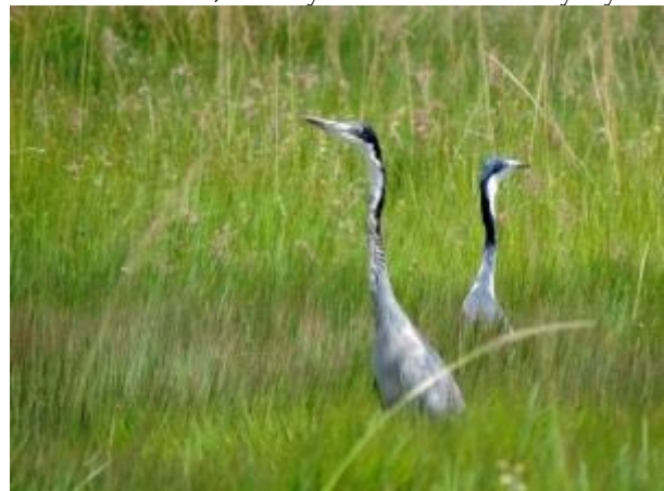
Black-headed Herons at Monavale

Finally, we proceeded to Monavale Vlei. On arrival, we feasted our eyes on a couple of Black-headed Herons foraging amidst the tall grass. The binoculars helped make them out clearly as they were quite some distance away. A few moments later, a Grey Heron flew lazily by.