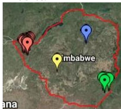
The four BirdLasser teams birded Harare, Hwange, Bulawayo & Gonarezhou

Congratulations to the winning team, YAB Hwange Hawks who birded around Hwange and saw 220 birds.