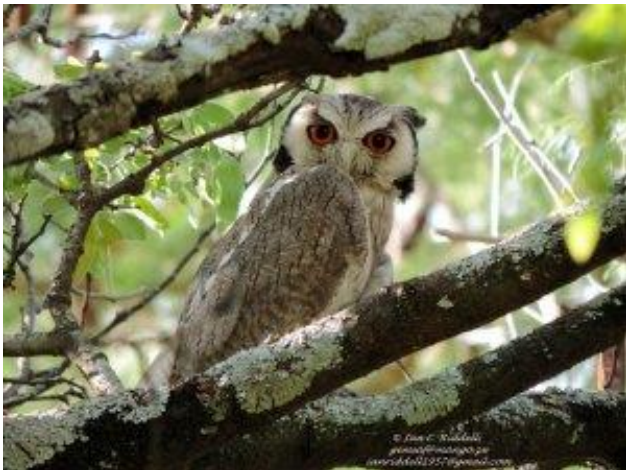
Southern White-faced Scops-owl

YAB Hwange Hawks found Southern White-faced Scops-owl, but they, Umgoosers and Gonarezhou Lassers all got Verreaux's Eagle-owl.