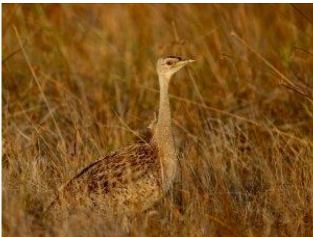
Red-crested Korhaan.

Four Bulawayo teams and YAB Hwange Hawks got Yellow-billed Kite, but only JB x2 found Verreaux's Eagle around Bulawayo, whilst Umgoosers found Long-crested Eagle. Martial Eagles were quite well distributed and were seen in Bulawayo, Harare, Hwange and Gonarezhou. Bateleurs were only picked up in