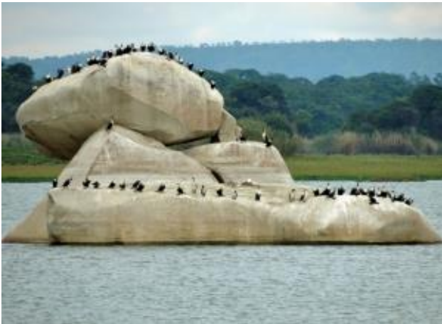
A count of the White-breasted Cormorants on the five rock perches, from photos I took, including the above, revealed 326 birds, a third more than the estimate from observers counting with binoculars. There is often a tendency to under-count large groups of waterbirds - Ed.

The previous visit to this location has gone down in the history of the branch as the occasion Vanellus spinosus was spotted, signalling a migration of southern African birders to the lake. No such sightings this time for the 10 members as the area is covered in dense weed and grass in which 1000 Spur-winged Lapwings could conceal themselves. However, there was plenty of interest for those who enjoy birding without adding to their life or southern African lists.